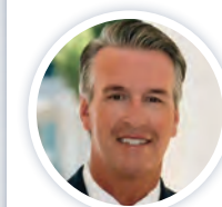
BARRY MOORE | Alabama Alabama National Guard