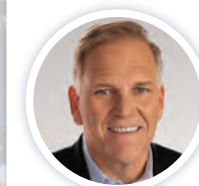
MIKE ROGERS | Michigan Army Officer, FBI Special Agent & Chairman of the House Intelligence Committee

Join us to do all we can to elect these Conservative Patriots to Congress and pass the America First agenda!